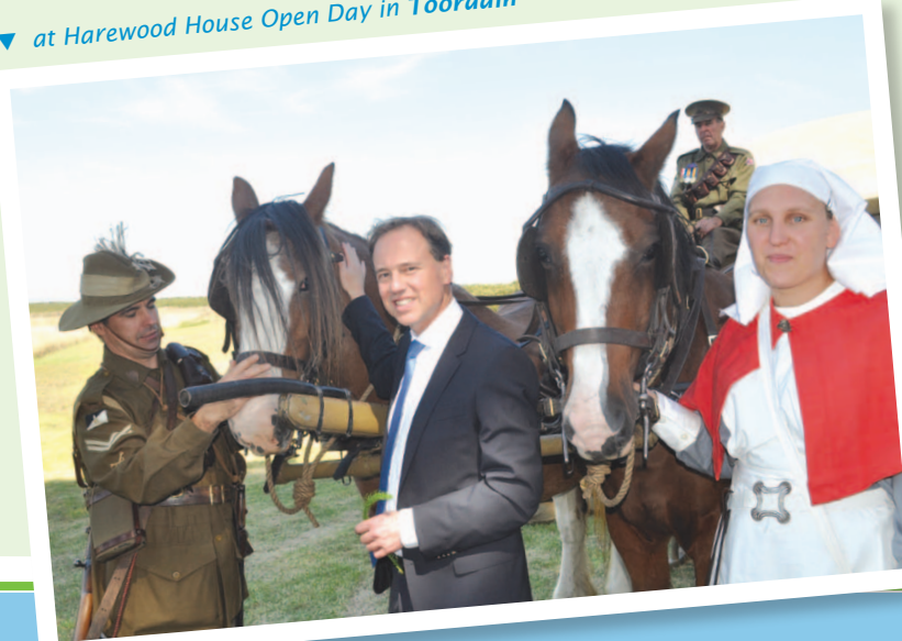
▼ at Harewood House Open Day in Tooradin