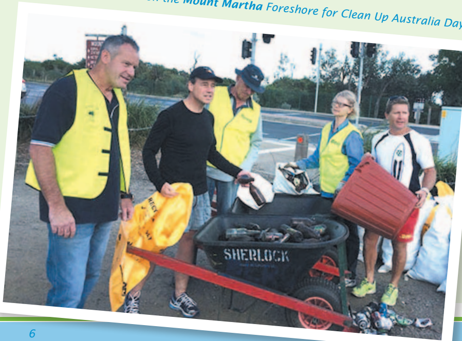
▼ clearing up rubbish on the Mount Martha Foreshore for Clean Up Australia Day