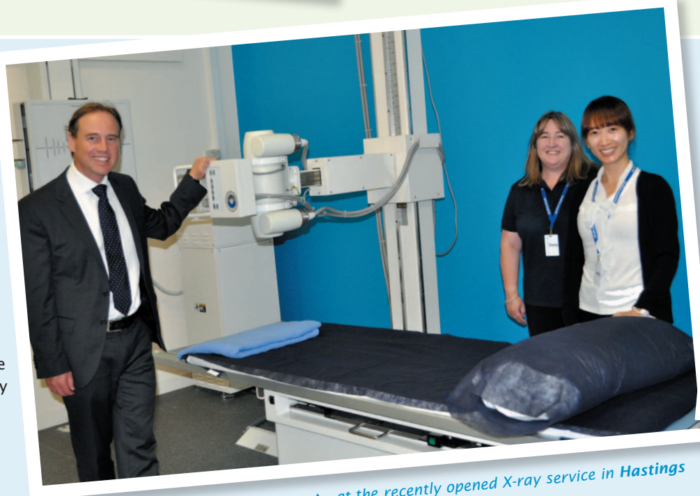
▲ at the recently opened X-ray service in Hastings

Spectrum Imaging provides a vital service for residents, allowing them to access X-ray facilities closer to home.