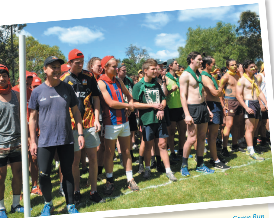
▲ running in the Lord Somers Camp Run