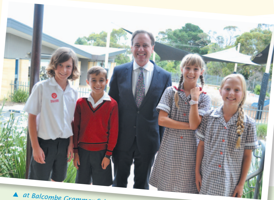
▲ at Balcombe Grammar School in Mount Martha for a Parliament on Tour visit