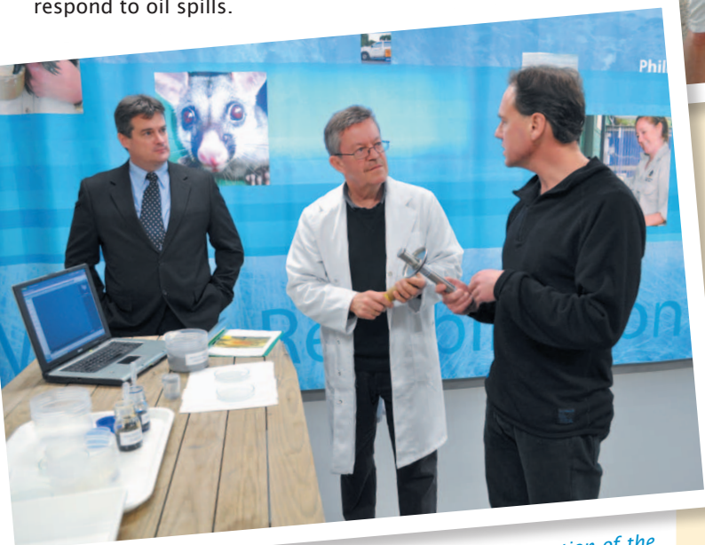
▲ watching a demonstration of the oil spill wand at Phillip Island

Having seen this technology demonstrated firsthand, I am excited about the potential it offers to improve the way we respond to oil spills.