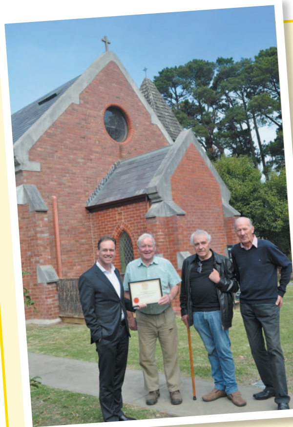
▲ with parishioners at St John the Evangelist Anglican Church in Flinders