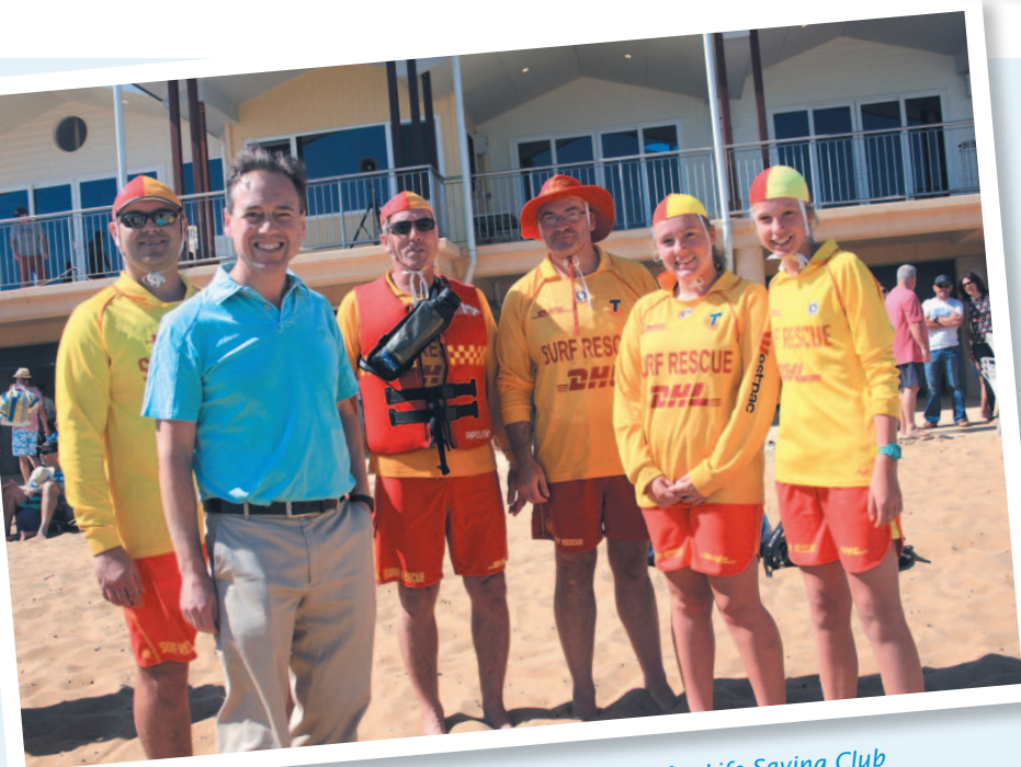
▲ with Mount Martha Life Saving Club members at the opening of the new clubhouse