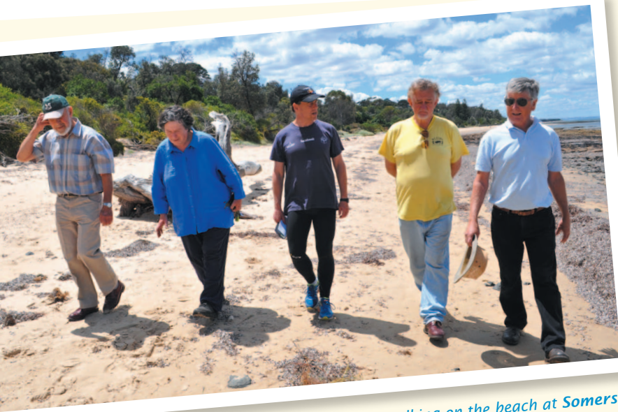
▲ walking on the beach at Somers discussing foreshore restoration