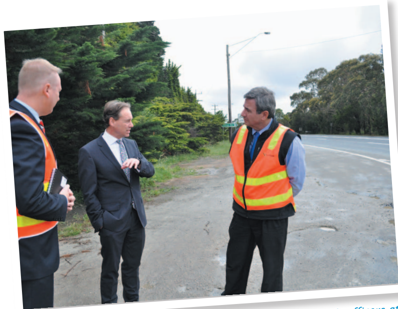
▲ with VicRoads officers at Forest Drive in Mount Martha