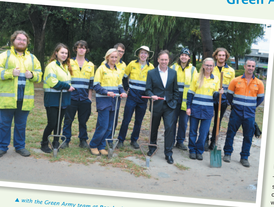
▲ with the Green Army team at Rosebud West

It was terrific to personally congratulate the first graduating Green Army team from the Mornington Peninsula at Rosebud West.