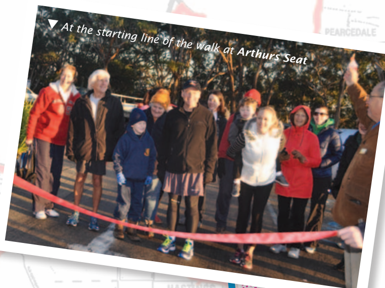
▼ At the starting line of the walk at Arthurs Seat

Your support throughout the walk was tremendous and your donations will make a real difference to the lives of children with autism.