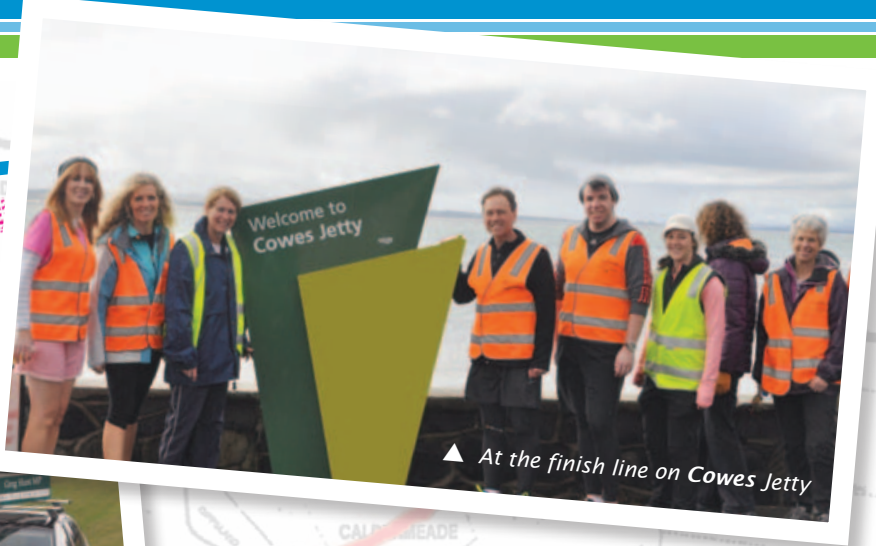
▲ At the finish line on Cowes Jetty