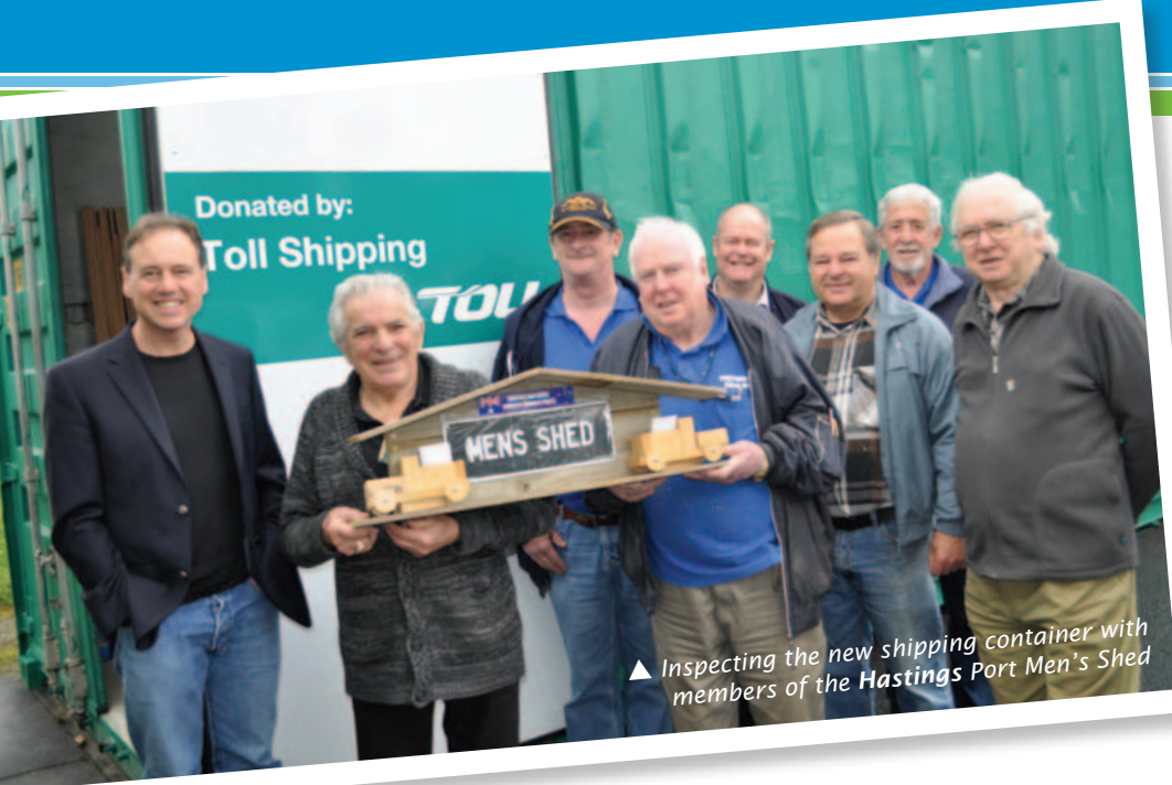
▲ Inspecting the new shipping container with members of the Hastings Port Men's Shed