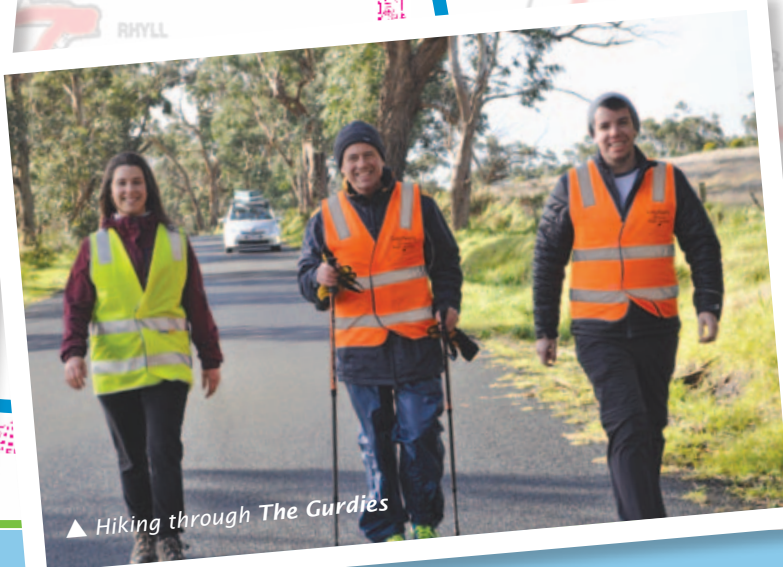
▲ Hiking through The Gurdies