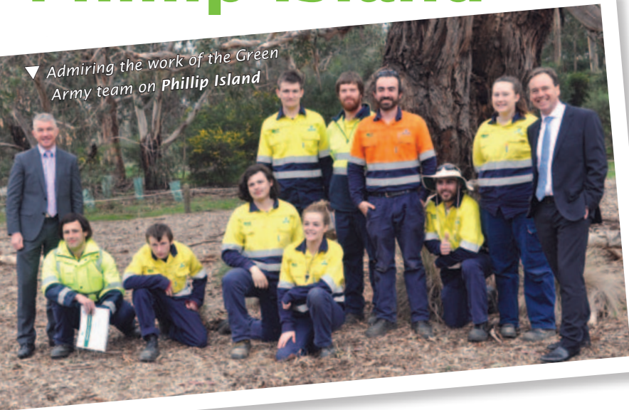
▼ Admiring the work of the Green Army team on Phillip Island