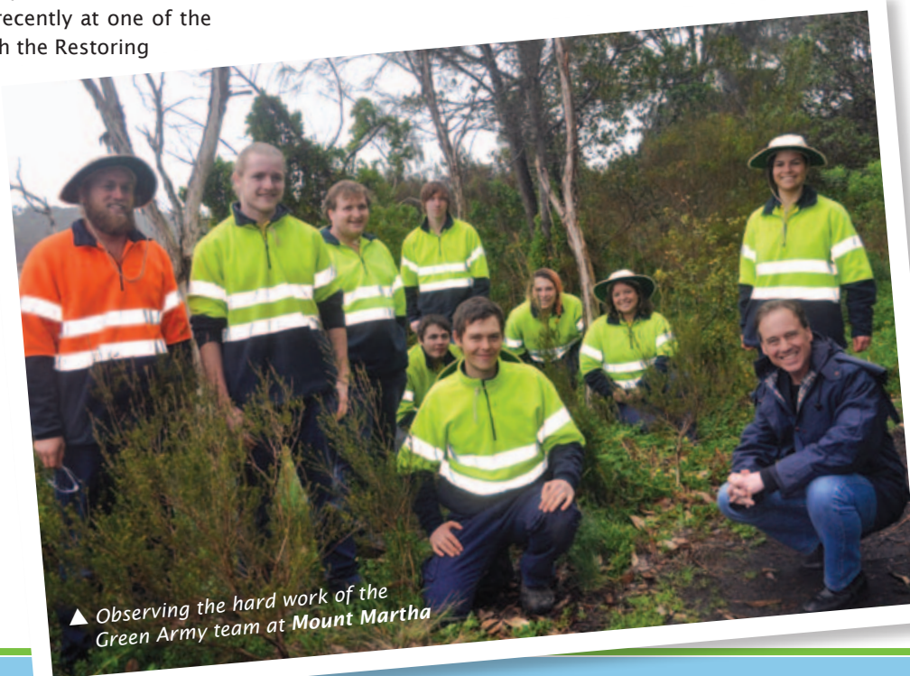
▲ Observing the hard work of the Green Army team at Mount Martha