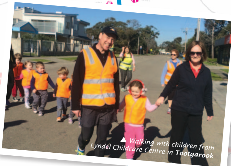
▲ Walking with children from Lyndel Childcare Centre in Tootgarook