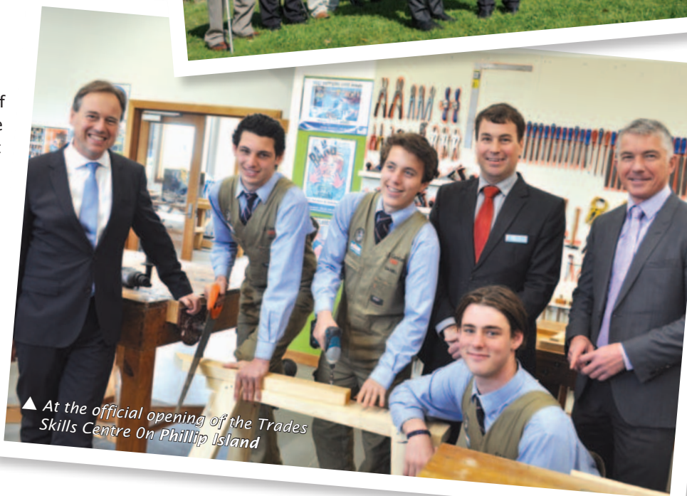
▲ At the official opening of the Trades Skills Centre On Phillip Island

It is brilliant to see young people thriving in a hands-on environment and learning trades that may become their future careers.