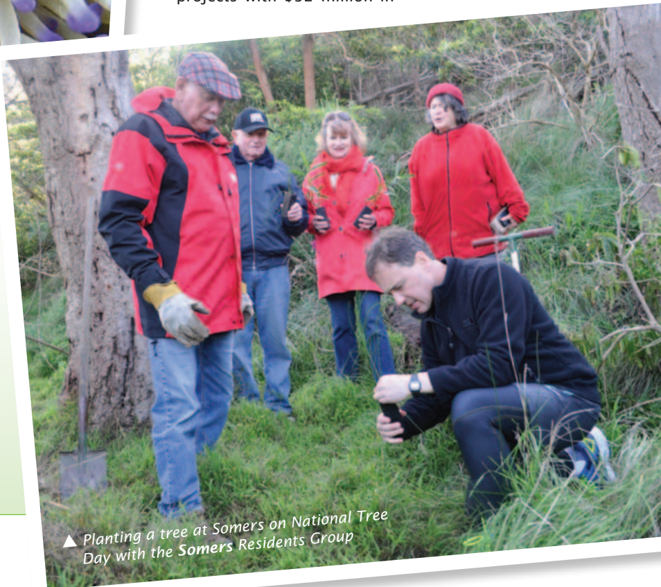
▲ Planting a tree at Somers on National Tree Day with the Somers Residents Group

I have established a new Office of Climate Change and Renewables Innovation to invest in new technologies that will assist us to make the transition to a cleaner and healthier environment.