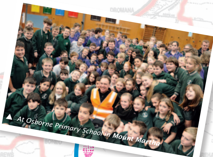
▲ At Osborne Primary School in Mount Martha