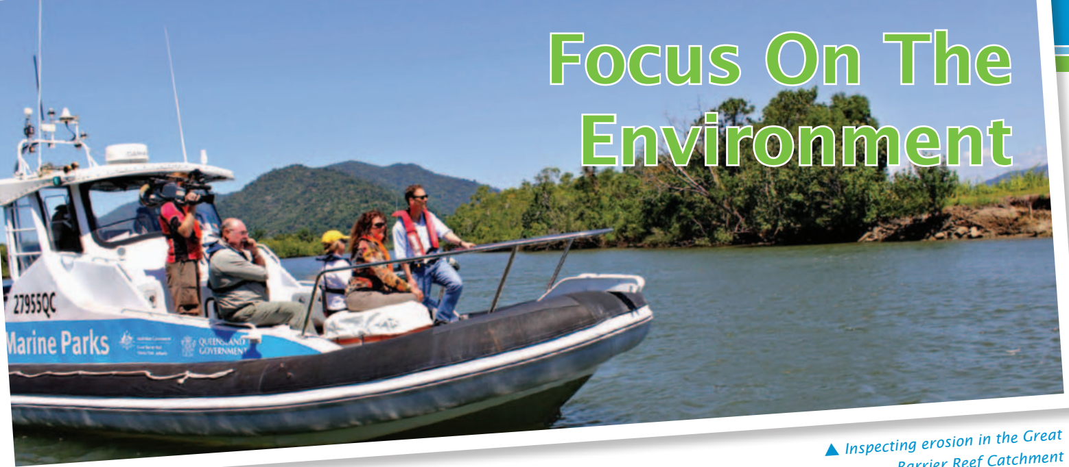
▲ Inspecting erosion in the Great Barrier Reef Catchment