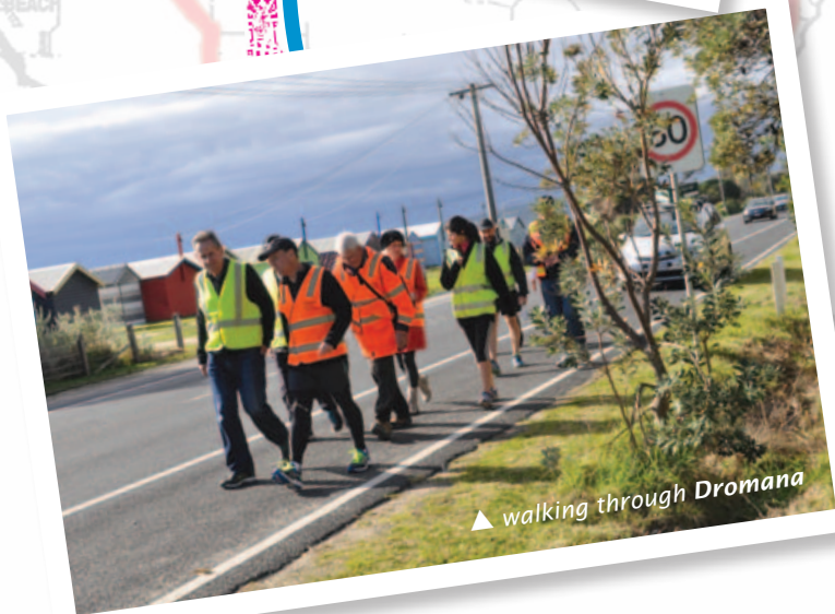
▲ walking through Dromana