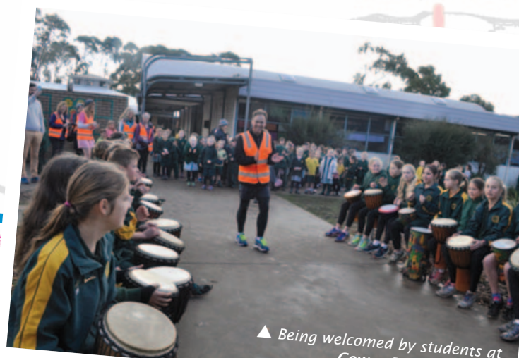
▲ Being welcomed by students at Cowes Primary School