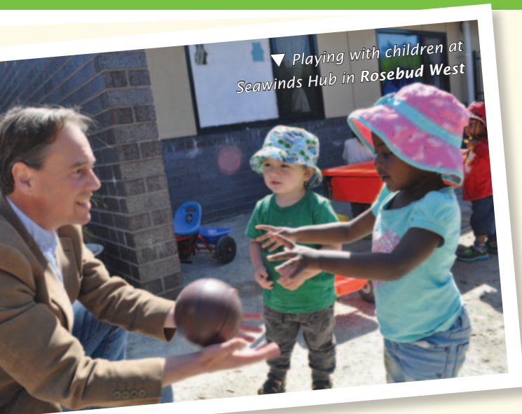
▼ Playing with children at Seawinds Hub in Rosebud West