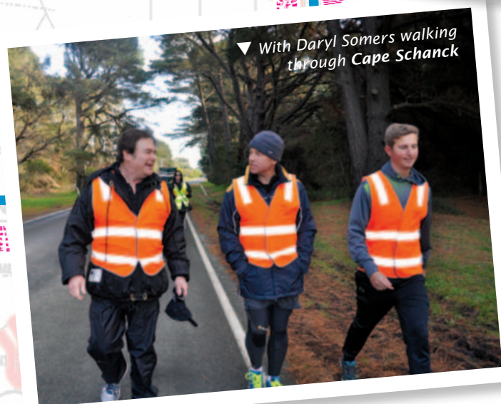
▼ With Daryl Somers walking through Cape Schanck