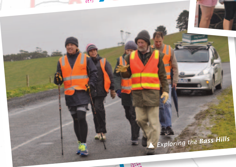
▲ Exploring the Bass Hills