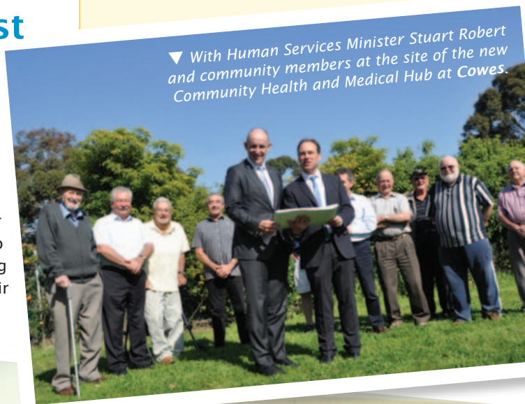
▼ With Human Services Minister Stuart Robert and community members at the site of the new Community Health and Medical Hub at Cowes.

I will continue to explore opportunities associated with the hub, including the option of co-locating Medicare, Centrelink and Veterans Affairs at the new hub.