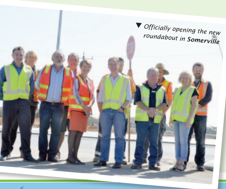
▼ Officially opening the new roundabout in Somerville