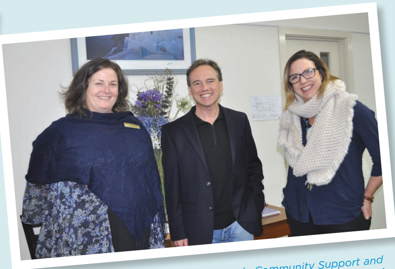
▲ at the Southern Peninsula Community Support and Information Centre in Rosebud

I am thrilled that this grant will allow Southern Peninsula Community Support and Information Centre to help the environment while reducing its power bills.