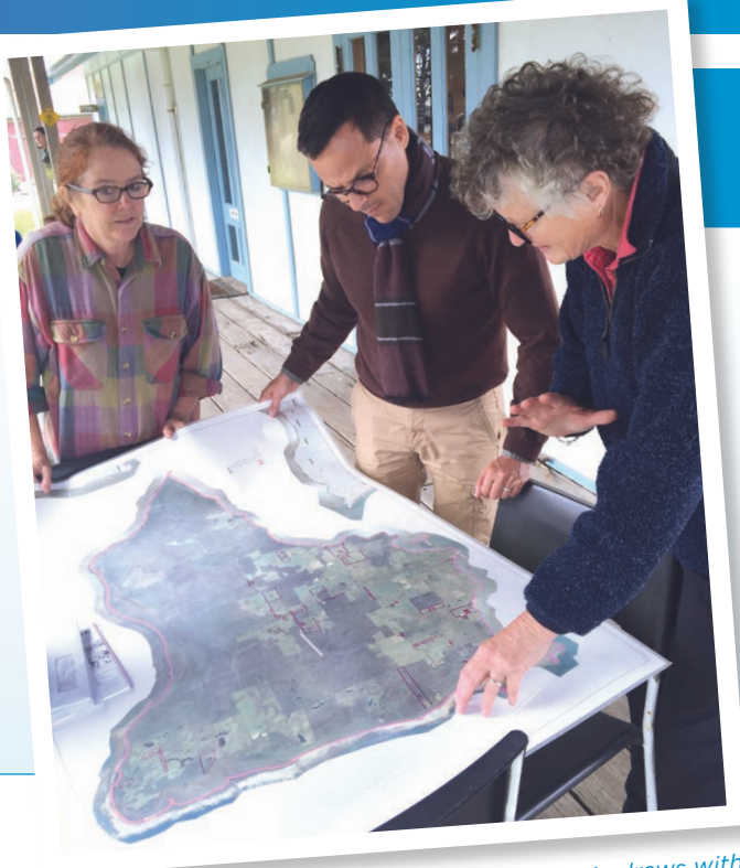
▲ Threatened Species Commissioner Gregory Andrews with community members on French Island discussing feral cat eradication

The French Island community is passionate about its wildlife and is championing the cause of native species. The Island has already reduced feral cat numbers to a point where eradication is now possible.