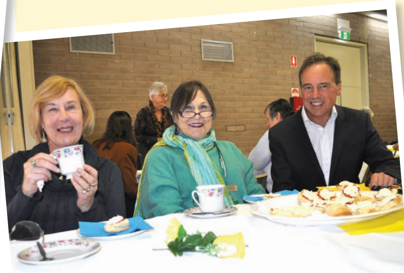
▲ at the Balnarring Country Women's Association's Biggest Morning Tea event

Attendees feasted on home-made scones and were entertained by the Semi Quavers string group. A thoroughly enjoyable event for a worthy cause, with more than $2million raised Australia-wide.