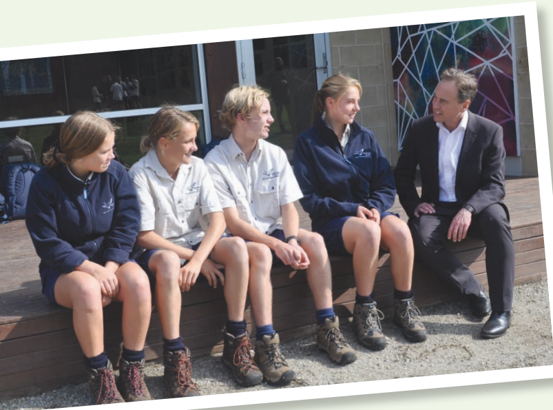
▲ at Newhaven College with Year 9 students