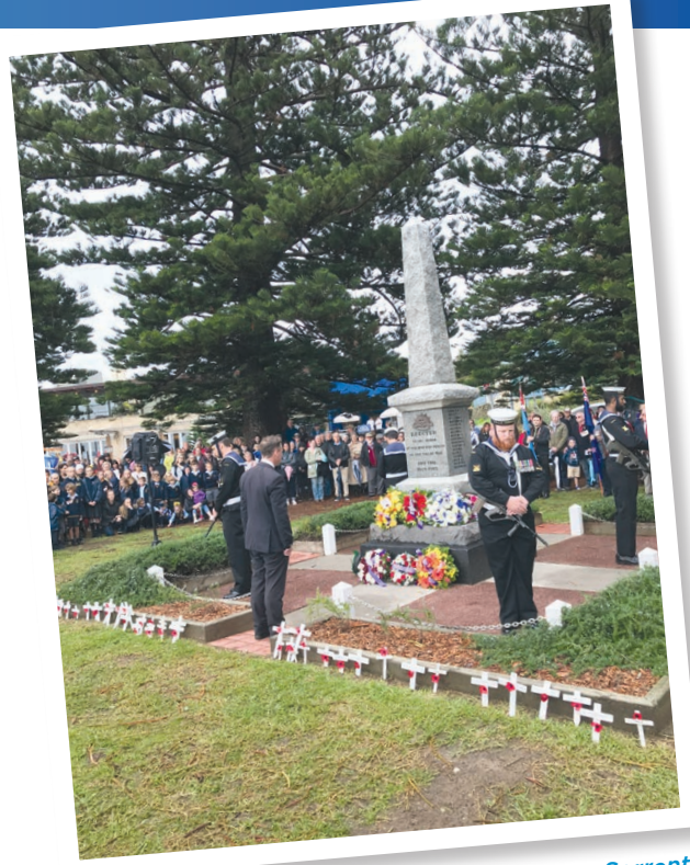
▲ commemorating Anzac day at Sorrento