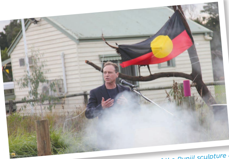
▲ celebrating the unveiling of the Bunjil sculpture at Willum Warrain in Hastings with a smoking ceremony