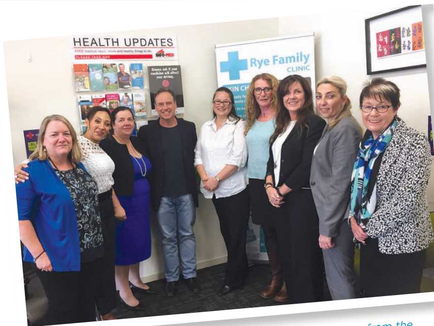
▲ with mental health nurses and representatives from the Primary Health Network at the Rye Family Clinic

Mental health services require a sensitive, tailored approach based on individual needs and that is exactly what these mental health nurses are delivering.