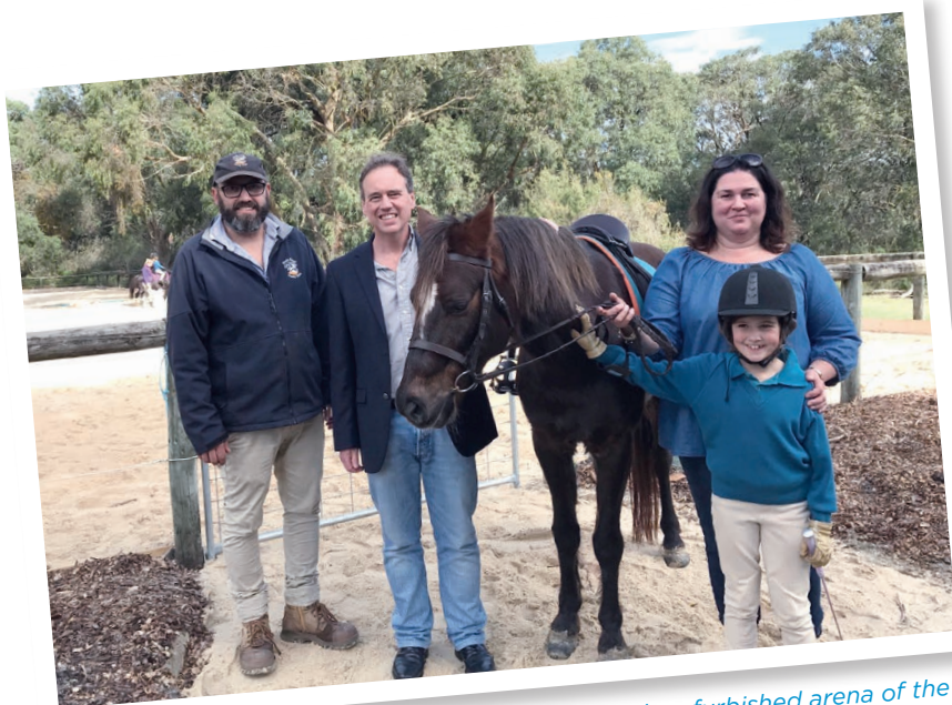
▲ at the newly refurbished arena of the Main Ridge Pony Club

This has made an enormous difference to the club, which has more than 75 members and hosts various competitions.