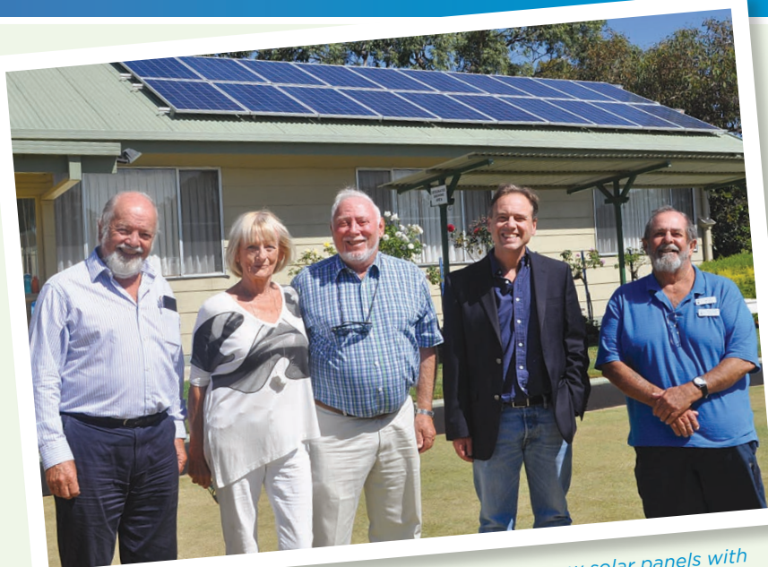
▲ observing the new solar panels with members of the Balnarring Bowls Club .

The Stronger Communities Program allows groups to complete projects that deliver social benefits to improve the vibrancy of our local communities.