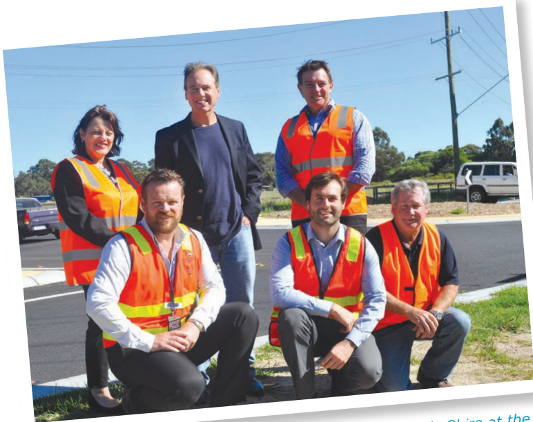
▲ with members of the Mornington Peninsula Shire at the intersection of Graydens and Boes Road in Hastings

Residents have long been concerned with the state of this intersection, which provides a crucial link for residents in the Hastings area so it is fantastic to see it completed.