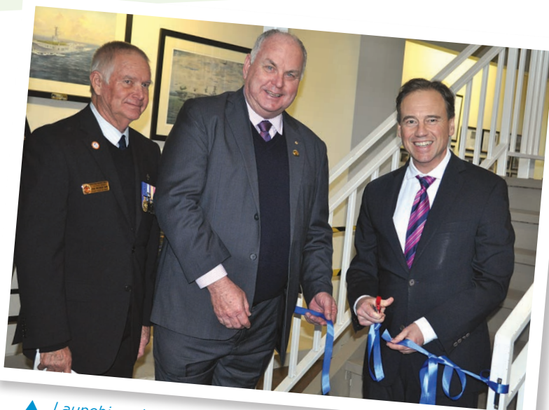
▲ Launching the National Vietnam Veterans Museum's history exhibition at Newhaven

I would encourage anyone on Phillip Island to visit the exhibition and learn about the museum's rich history. The Exhibition runs until November 5.