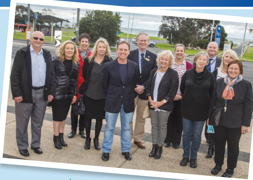
▲ announcing funding for CCTV cameras at Rye

Everyone has the right to feel safe in their community and these cameras will send a clear message to any would-be offenders that they will be caught.