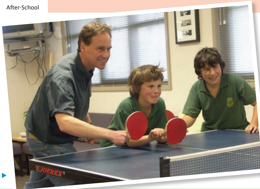
table tennis tournament at Cowes.