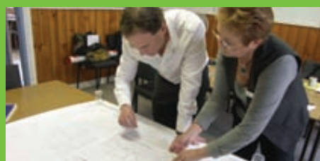
▲ examining development plans at Cowes

Exciting plans for a health hub at Cowes – pg 4