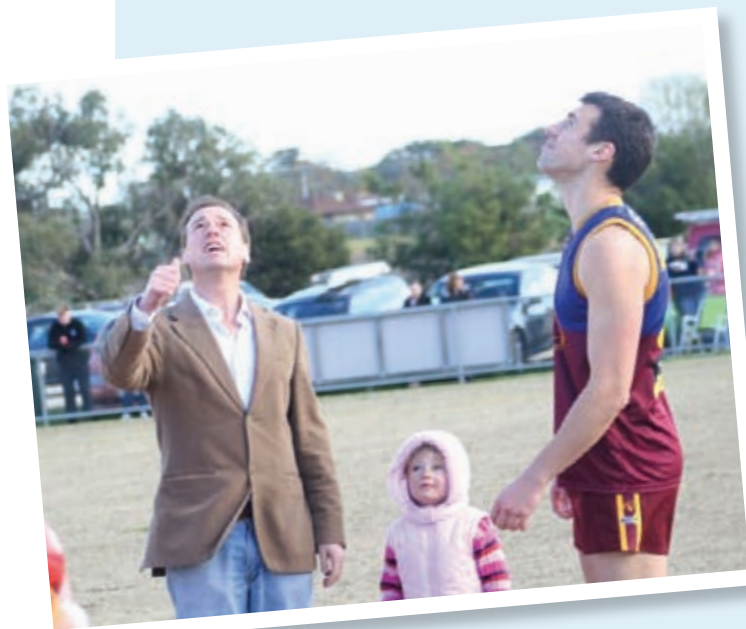
▲ Tossing the coin at the start of the Tyabb vs Sorrento football match at Tyabb .