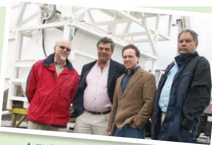
▲ meeting with inventors of a prototype tidal power turbine - the Sundermann Turbine - which is currently being tested in the waters off San Remo . This technology could be used by indigenous communities in the Kimberley.