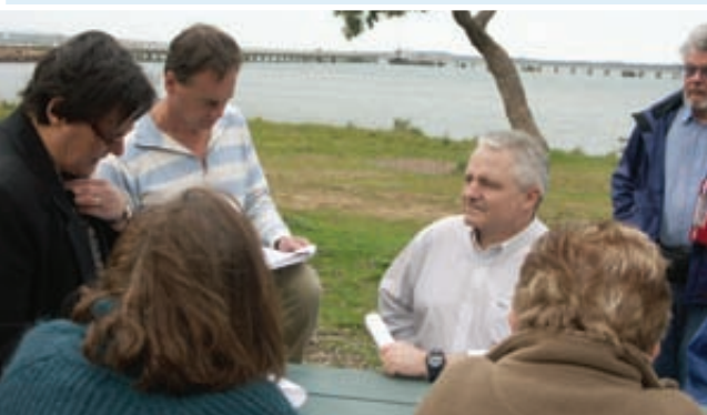
▲ drawing up a plan of action with Crib Point residents.

I have asked Peter Garrett to halt the project on environmental grounds and will continue an unstinting campaign with locals to get this decision overturned.