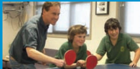
▲ table tennis tournament at Cowes Primary

Exciting plans for a health hub at Cowes – pg 4