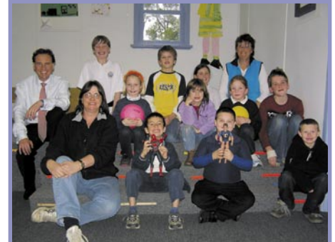
Helped obtained funding for St Mary's Child Care Service, Hastings