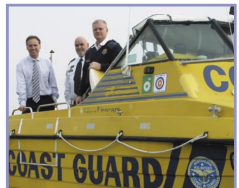
Visited Volunteer Coastguard Service and announced Federal Funding of $25,000, Safety Beach