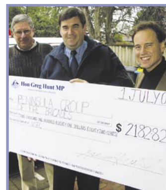
Presenting a cheque for $2,182 to the Peninsula Group of Fire Brigades