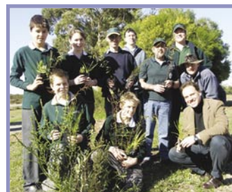
Presenting $12,000 in Federal assistance to the Warringine Park Committee of Management to help preserve our unique natural environment