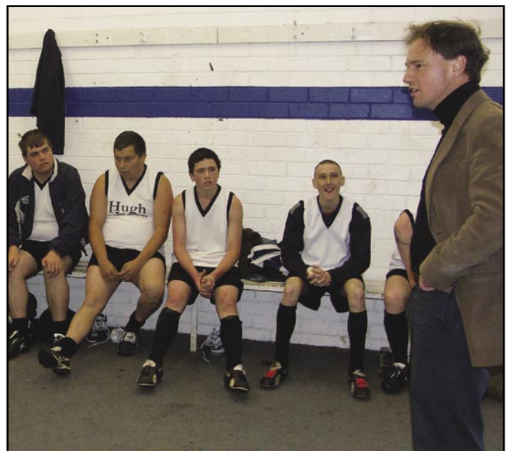
Delivering a pre-game address to the Western Port Warriors

The Warriors played a spirited game and the community of Hastings - their community - can feel proud of them for their commitment to play for the area and the difference they are trying to make to their lives.