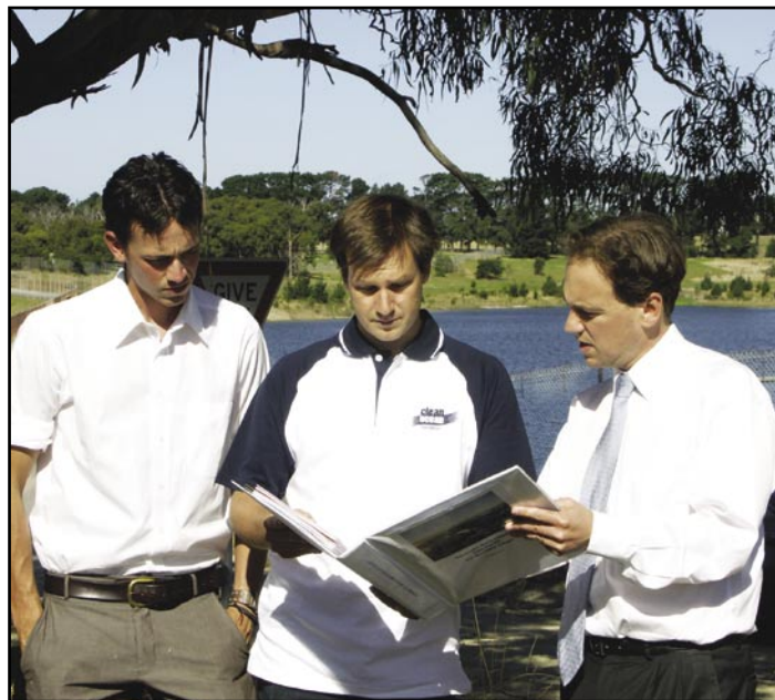
On site at the beautiful Devil Bend Reservoir working with the Clean Ocean Foundation to help clean-up our waterways through the Commonwealth's Community Water Grants program

The Federal Government has committed $200 million over five years through the Community Water Grants programme as part of the $2 billion Australian Government Water Fund. Anyone interested in making an application as part of the next round of Community Water Grants should go to www.communitywatergrants.gov.au .