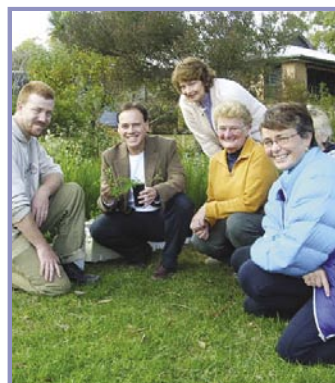
Helping the Lang Lang Foreshore Committee of Management to revegetate the Jam Jerrup Foreshore