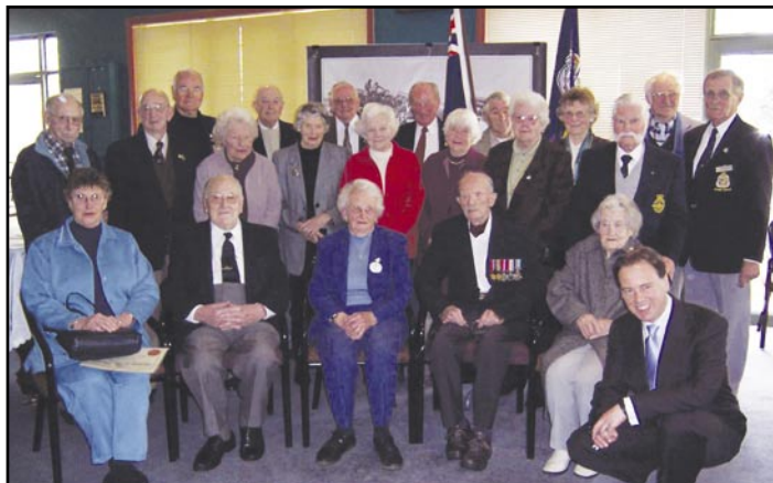
With recipients of the Victory in the Pacific Commemorative medallion at the Phillip Island RSL