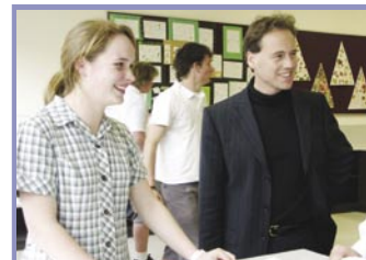
At Rosebud Secondary College working as principal for a day