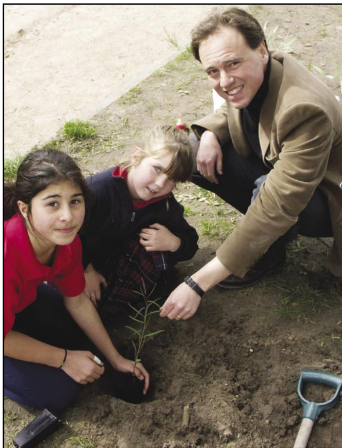
Helping students from Mt Martha Primary revegetate the local environment