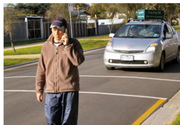
Walking through Eastbourne enroute to Rye