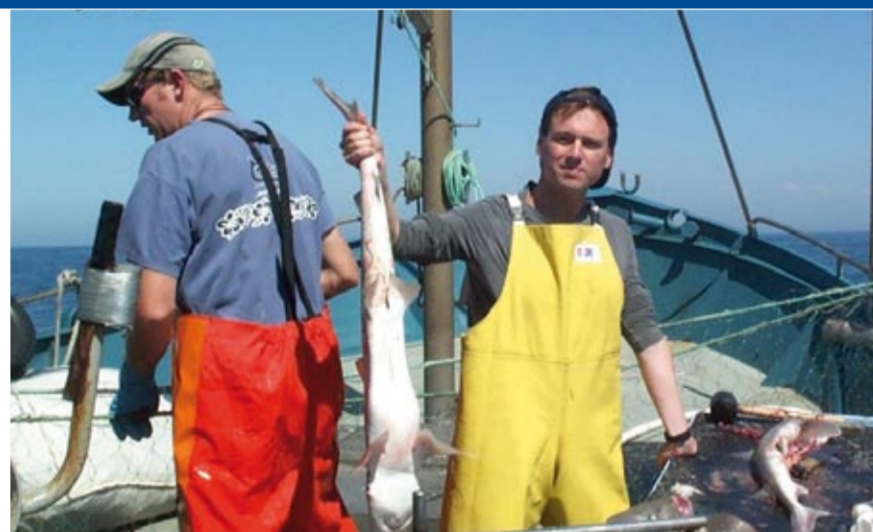
Working with San Remo's commercial fishermen

Helping San Remo & Bass Coast fishermen rebuild the Co-operative