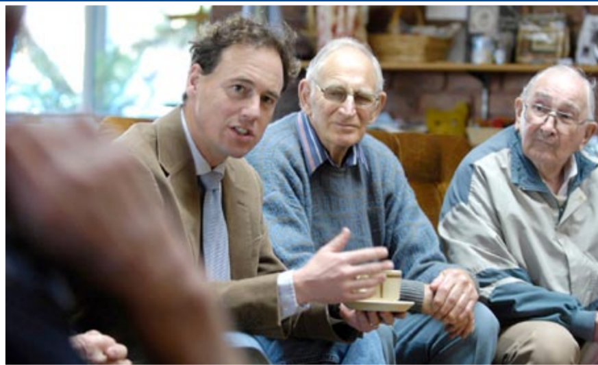
With residents of the Village Glen, Rosebud, discussing the Aquatic Centre and other services for the Peninsula

Working for Aquatic Centres for Rosebud and Phillip Island