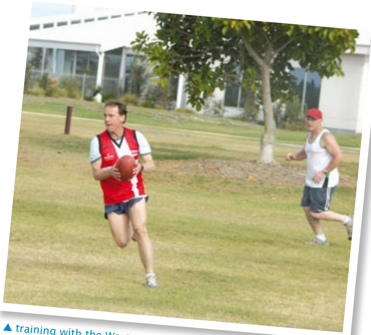
▲ training with the Western Port Warriors Football Club at Hastings