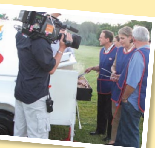
▲ cooking up a storm for the Sunrise crew

For those interested in tuning in, the segment appears each Friday just after the 7am news.