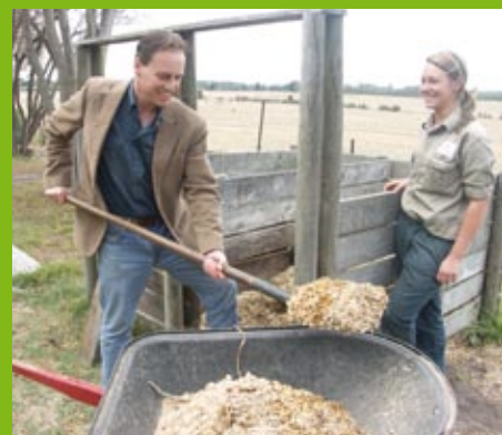
▲ lending a hand at the Green Corps launch at Sages Cottage

Green Corps launch at Sages Cottage pg 6