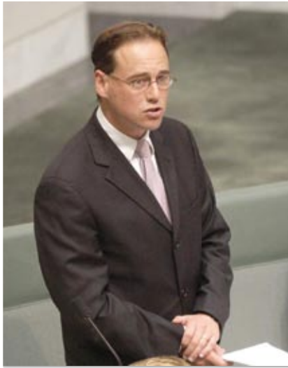
▲ speaking in Parliament