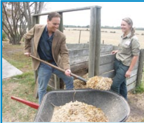
▲ lending a hand at the launch of the latest Green Corps project at Sages Cottage, Baxter .