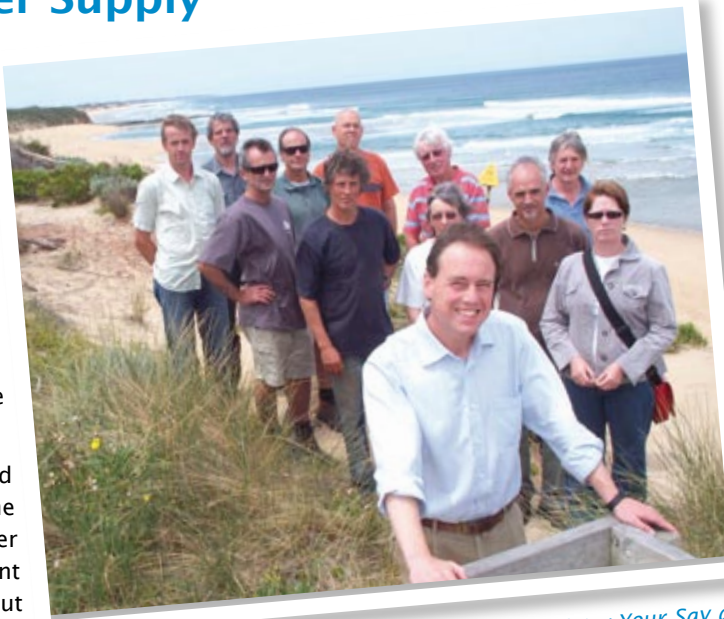
▲ with members of Your Water Your Say at the site of the proposed desalination plant

I have spoken in Parliament on this issue and written to the Victorian Government as well