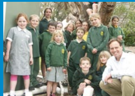
with Cowes P.S. ▲

50 local schools and community organisations benefit pg 8