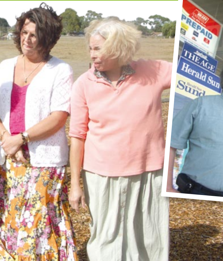
▲ with Somerville residents at the Barber Reserve

Local school children use the reserve as a short cut on their way home from school and residents fear a child could be killed or injured.