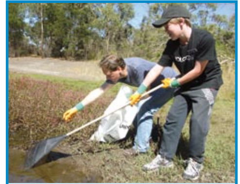
▲ clearing rubbish from Unthanks Reserve at Somerville on Clean Up Australia Day.