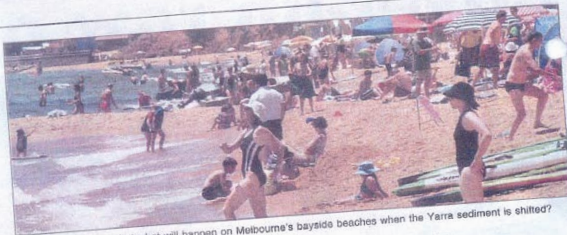
Summer daze: but what will happen on Melbourne's bayside beaches when the Yarra sediment is shifted?