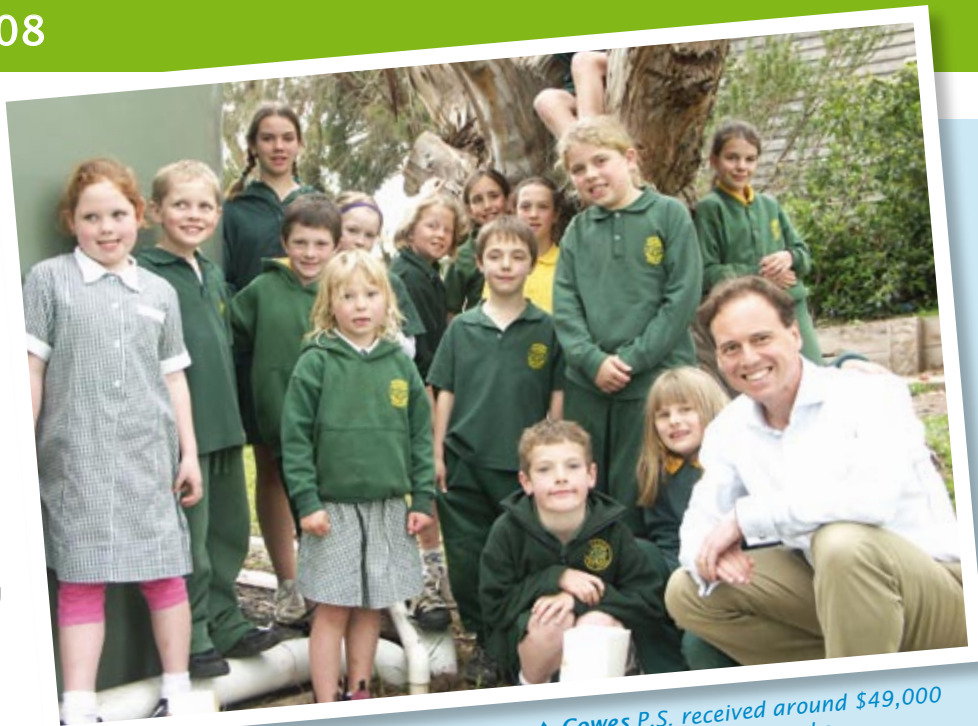
▲ Cowes P.S. received around $49,000 to install new water tanks

Collectively, these projects will save close to 64 million litres of fresh drinking water each year.