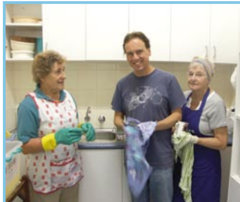
▲ helping with the washing up after a busy lunchtime session at Rosebud's Vinnie's Kitchen.