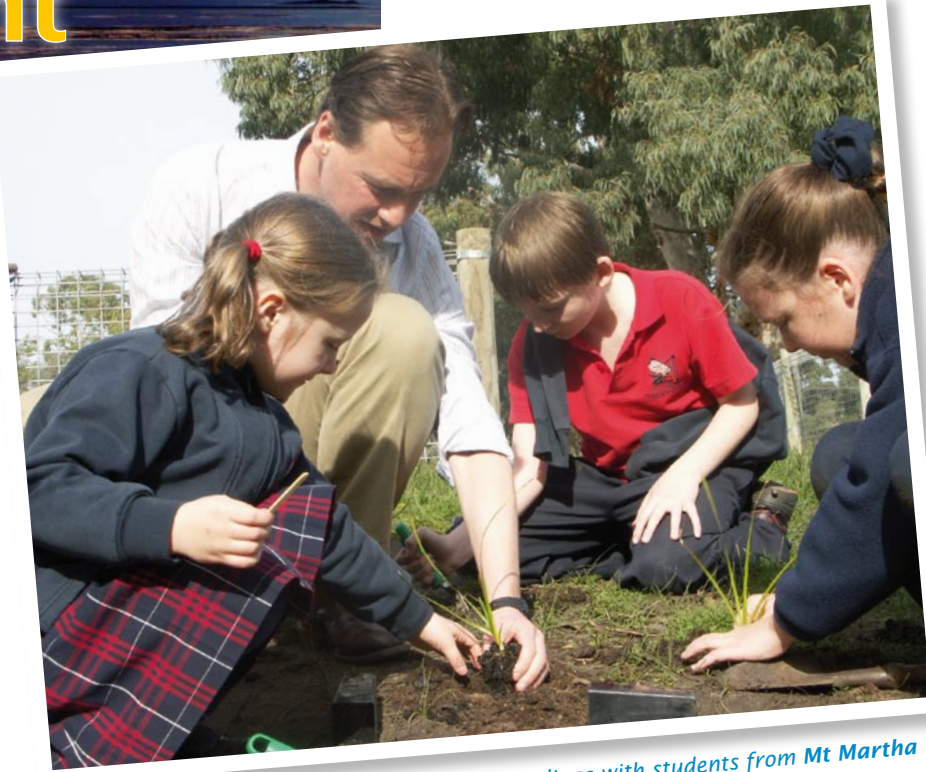
▲ planting saplings with students from Mt Martha Primary School on National Schools Tree Day