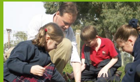
tree planting at Mt Martha Primary ▲