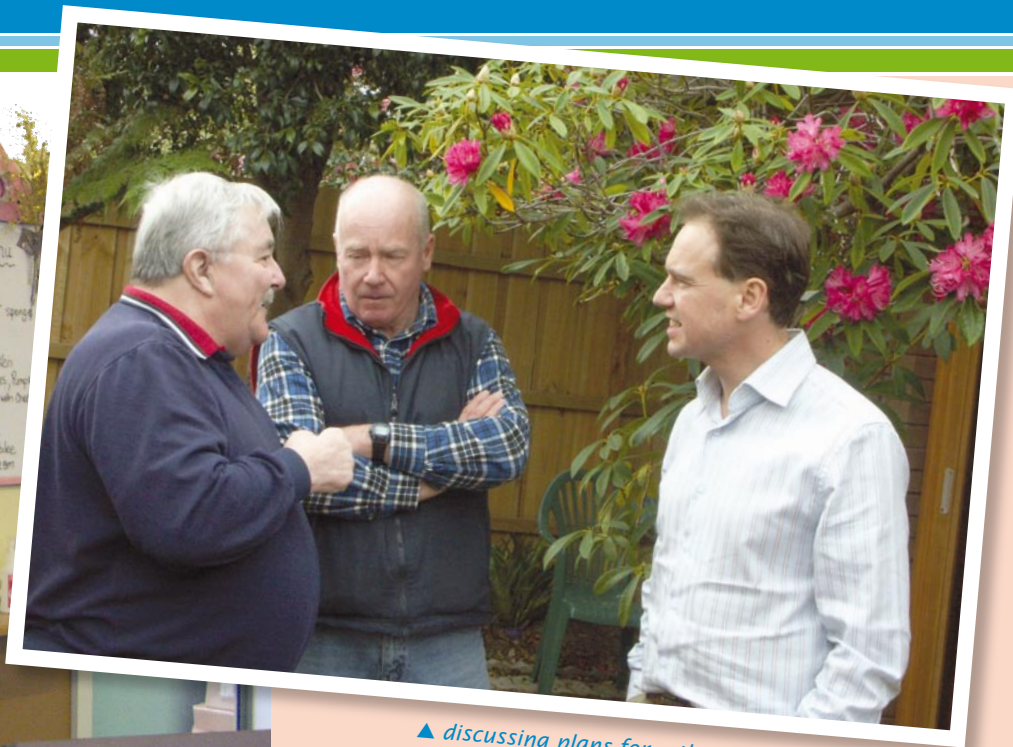
▲ discussing plans for a the new outdoor area at the Southern Peninsula Veterans' Centre Rosebud

Although she has long since retired, she continues to take a keen interest in current affairs and politics and has an enormous amount of good advice and wisdom to pass on.