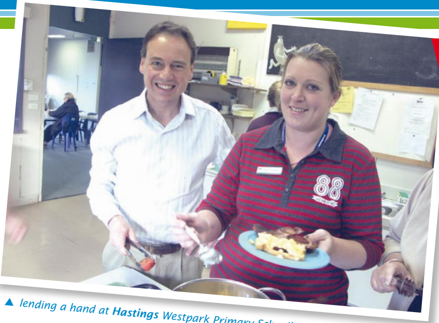
▲ lending a hand at Hastings Westpark Primary School's Breakfast Club