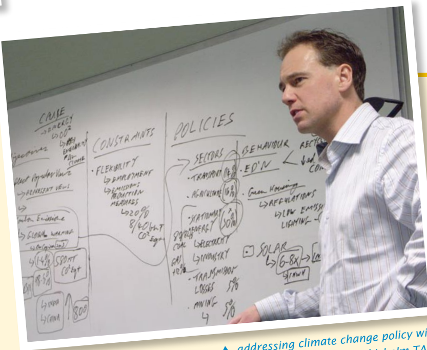
▲ addressing climate change policy with students at Rosebud's Chisholm TAFE