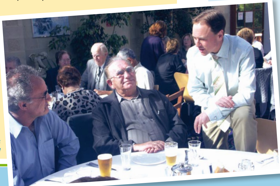
▶ with members of the Greek community at the Dromana Hotel

Perhaps their greatest achievement, however, is in fostering a genuine sense of community and connection among the Peninsula's many elderly Greek residents.