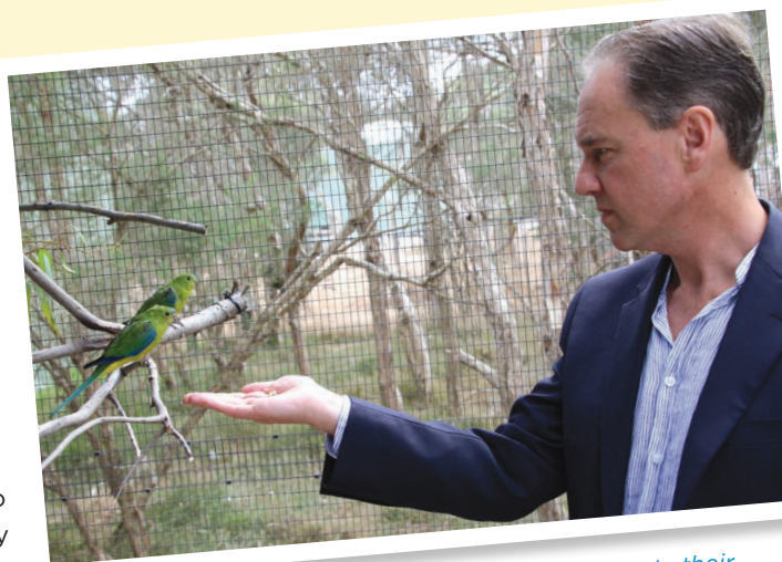
▲ feeding two orange-bellied parrots their food at Moonlit Sanctuary, Pearcedale

I congratulate the team at Moonlit on their tireless efforts to protect threatened species.