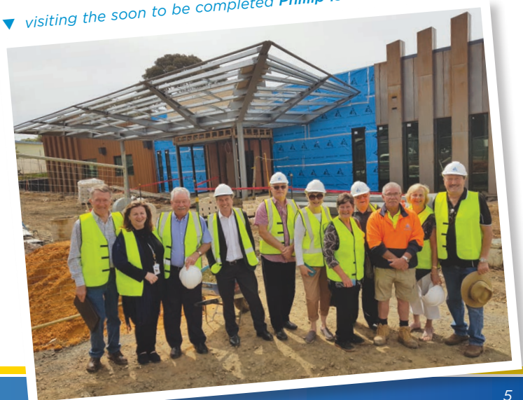
▼ visiting the soon to be completed Phillip Island Health Hub