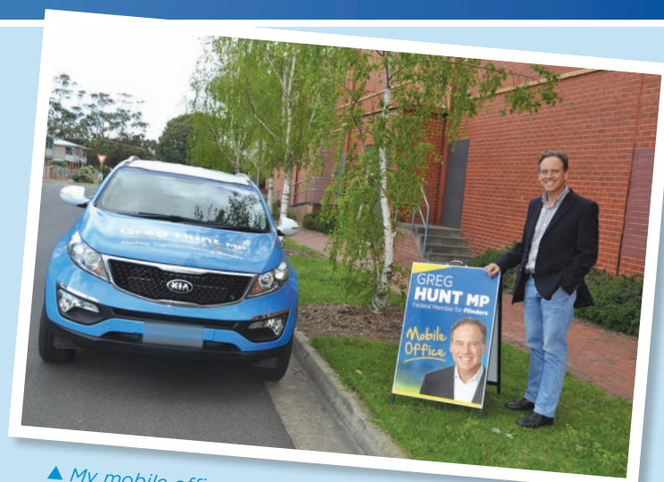
▲ My mobile office will be running throughout 2018

There will be plenty of mobile offices throughout the year so residents should stay tuned to my website and social media to find when they will be occurring.