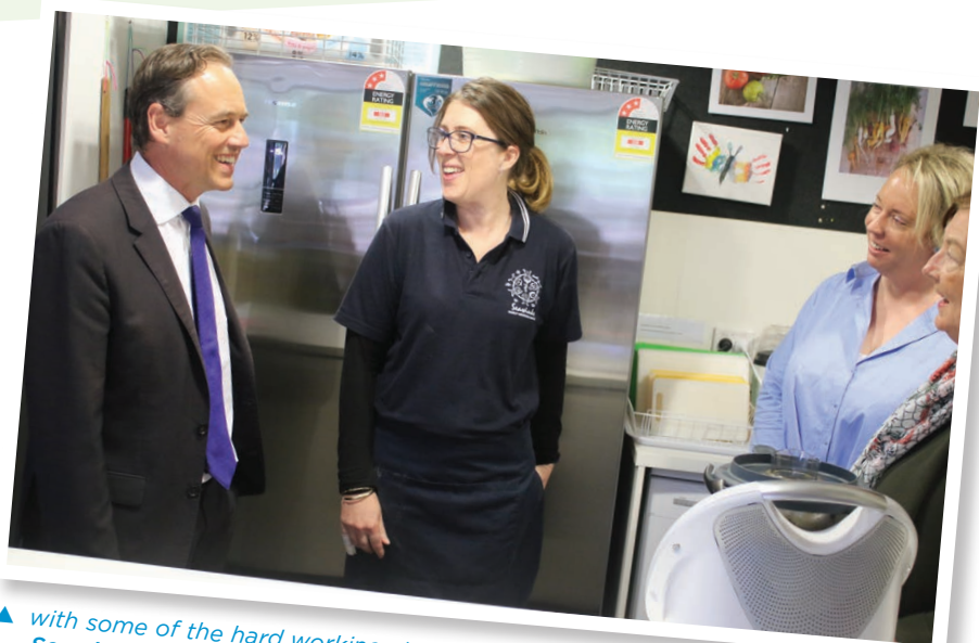
▲ with some of the hard working staff at Seawinds Community Hub

Seawinds received $6,891 under the Turnbull Government's Stronger Communities Programme to upgrade their kindergarten kitchen facilities, which look after and prepare food for the many children who visit the centre.