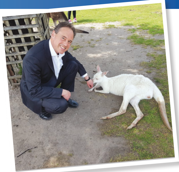
▲ visiting the wildlife at Maru Koala and Animal Park in Grantville