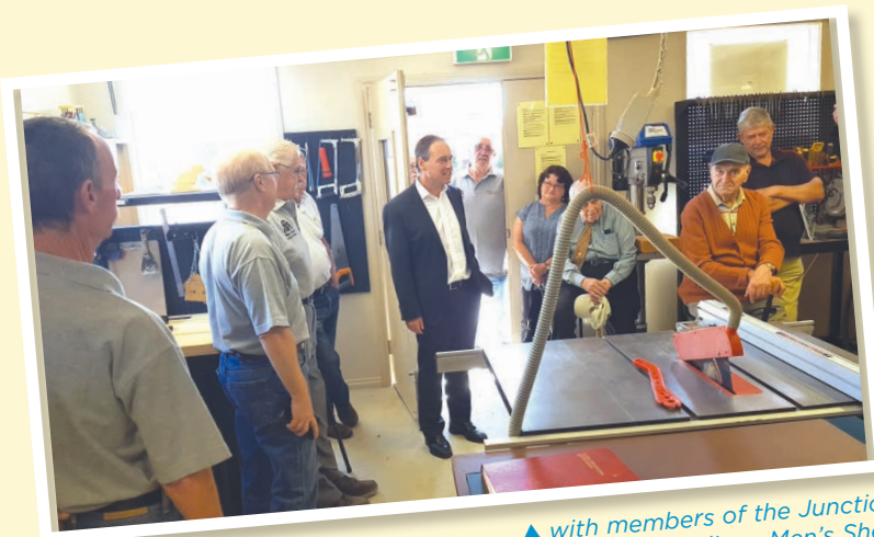
▲ with members of the Junction Village Men's Shed

It was fantastic to visit Aveo Botanic Gardens Retirement Village to officially reopen the Junction Village Men's Shed .