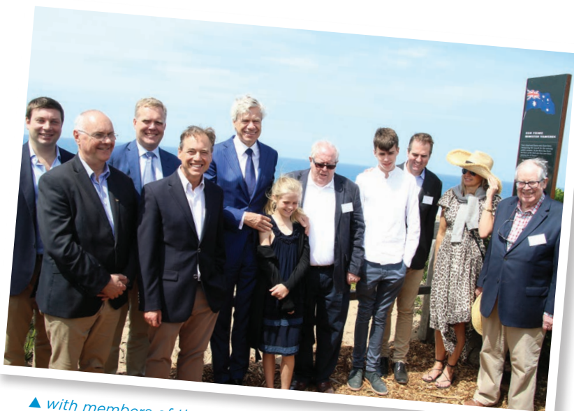
▲ with members of the Holt family at the Harold Holt Memorial in Point Nepean National Park

It is incredibly important that we honour the date of his loss, especially on such a milestone anniversary and this funding will help ensure the memorial will continue to be a fitting tribute.