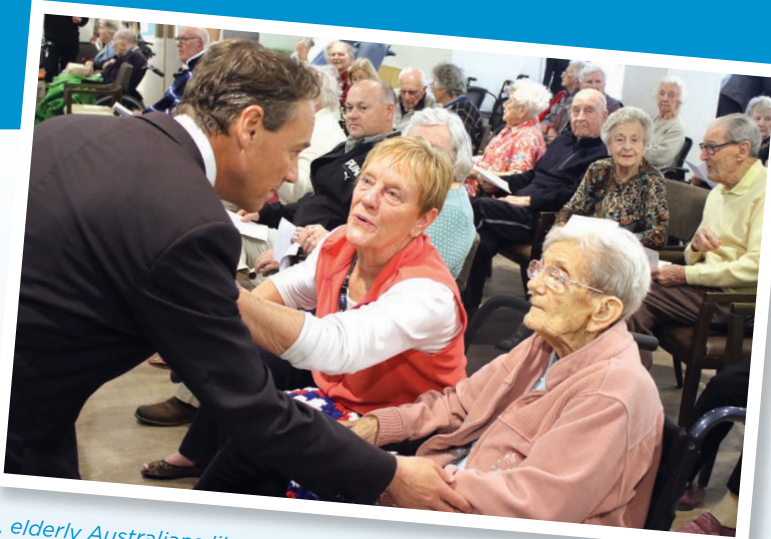
▲ elderly Australians like those at Ti Tree in Rosebud will have free of charge access to vaccines for this flu season

These new vaccines have been fast-tracked to ensure lives are saved and that older Australians receive greater protection.