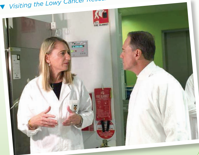
▼ Visiting the Lowy Cancer Research Centre in Sydney

We are committed to continuing to invest in research to find the answers to the challenges of these diseases.