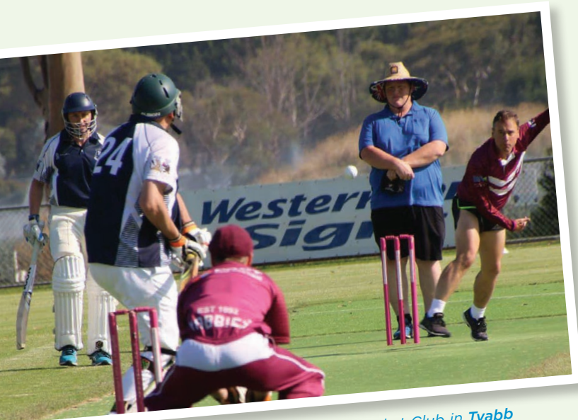
▲ with the Victoria Police Xi and Tyabb Cricket Club in Tyabb

All proceeds from the food and bar at the game went to the Foundation and I want to thank everyone involved for supporting such a great cause.