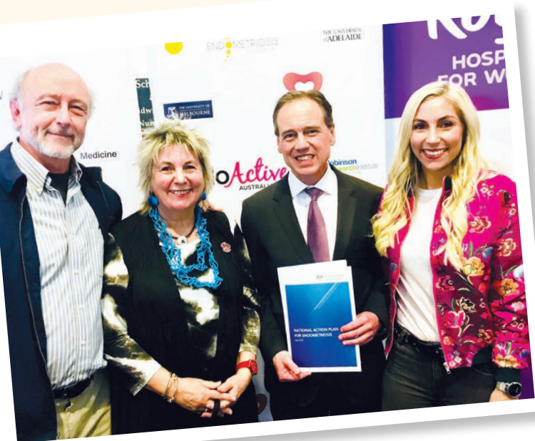
◀ Announcing Australia's first National Action Plan for Endometriosis

Many have suffered in silence for far too long and we are acting to help the 700,000 Australian women and girls suffering from this condition.