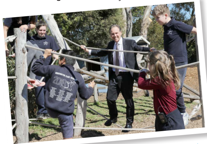
▲ Chatting with students at Mornington Park Primary School