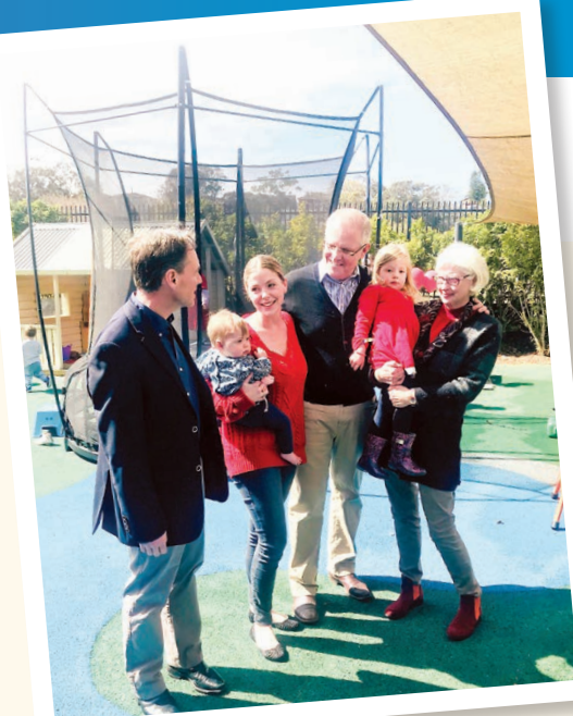
▲ With Prime Minister Morrison and families whose lives have changed thanks to the PBS listing of Orkambi

Our commitment to the PBS is rock solid. Together with Medicare, it is a foundation of our world-class health care system.