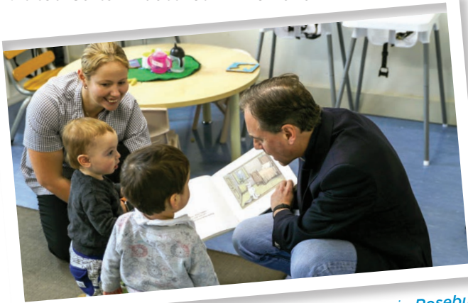
▲ Lending a hand at Goodstart Early Learning in Rosebud