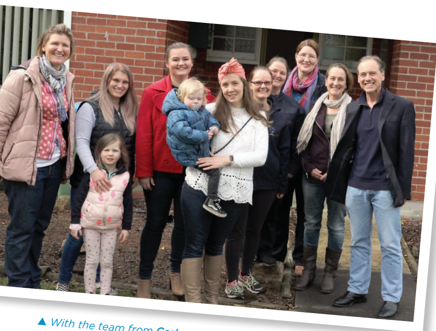
▲ With the team from Cerberus Cottage

For more information visit www.cerberuscottage.com.au