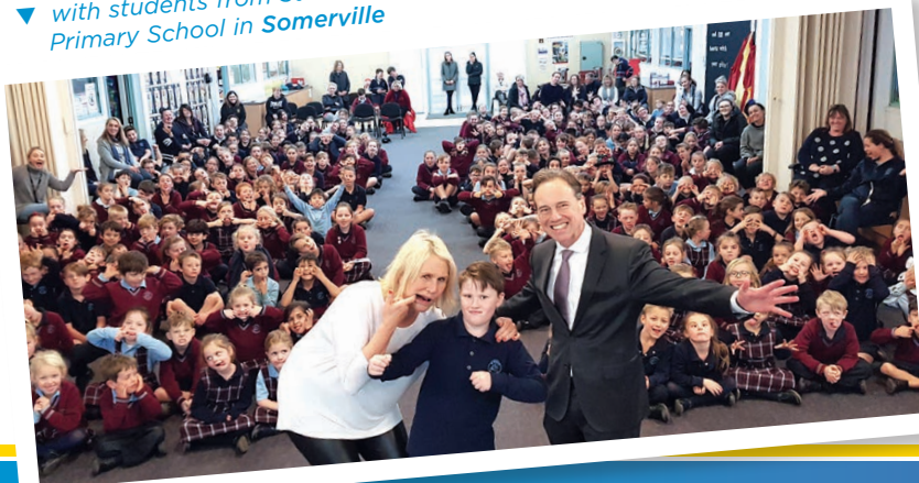
▼ with students from St Brendan's Primary School in Somerville