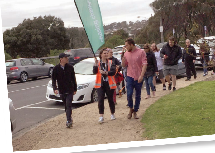
▲ Walking proudly with the community at the World Suicide Prevention Day Walk