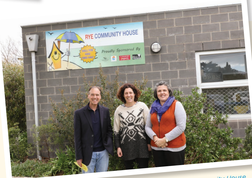
▲ All smiles with the team at Rye Community House

The Community House received over $11,000 to install rooftop solar panels, and connected batteries, which will reduce their power bills, freeing up vital funds to support their tremendous efforts for the Rye community.